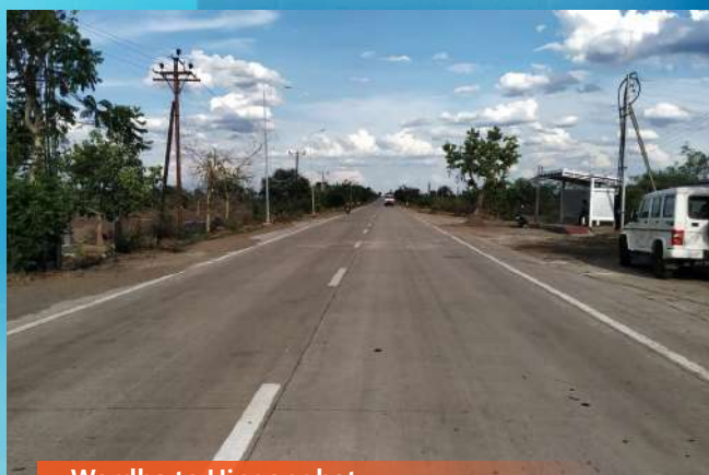
Wardha to Hinganghat