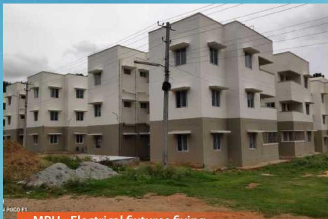
MPH - Electrical fixtures fixing